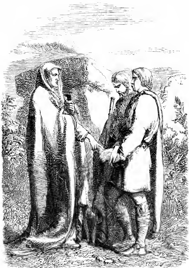
HILDA AND THE TWO BROTHERS.—p. 158.